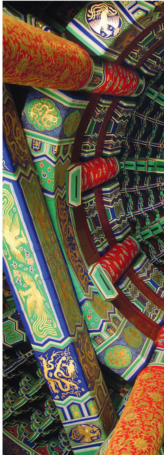
“CEILING OF TEMPLE FROM HEAVEN”